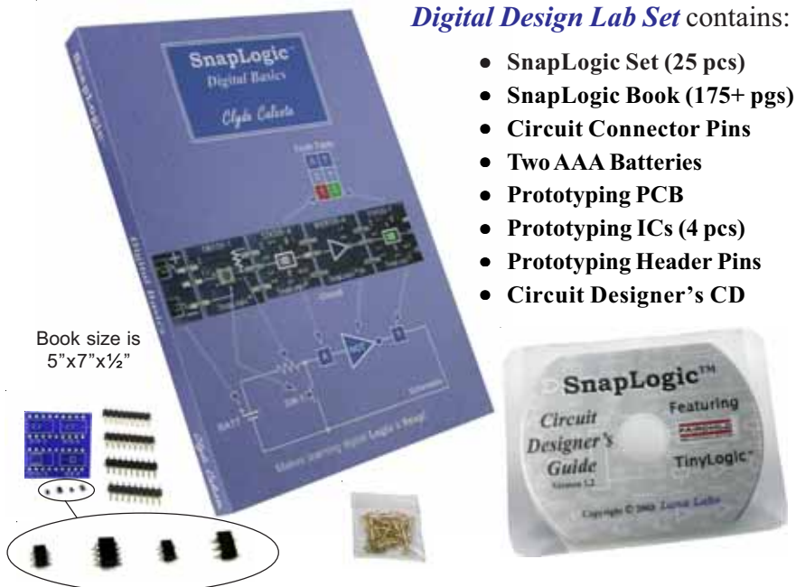
Book size is 5"x7"x1/2"